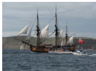
Duyfken in sail past