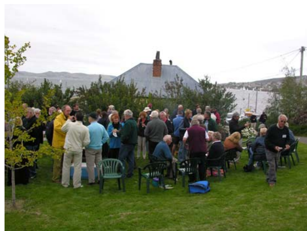
Some of the interstate visitors at the Welcome Bar - Q