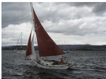
Sail past, unknown Gaff

General Meetings are on the 3 rd Monday of each month, inc. public holidays, but not in the month of January.