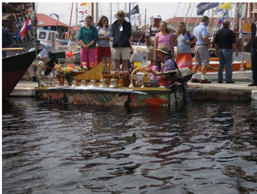
Dutch Music boat