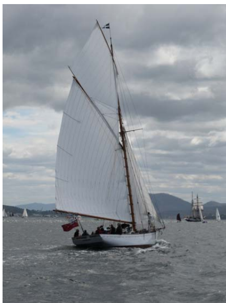
Storm Bay in Sail Past