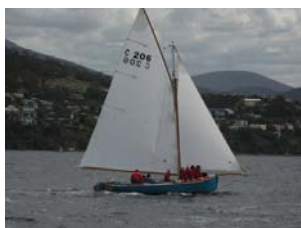
Nice Coua boat from NW coast in sail past