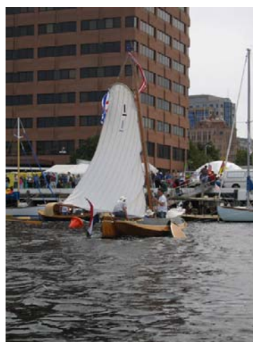
One of the visiting Dutch boats