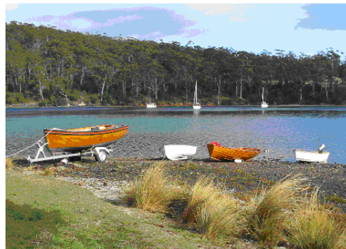
Members' boats at the Duckpond 2005

So ... all we need now is plenty of members to come along with gloves etc to have a great boating weekend and help with the clean up. Bring along both big and little boats and join in the fun. For those coming in little boats you can camp at the "Duckpond" or check out some B&Bs nearby.