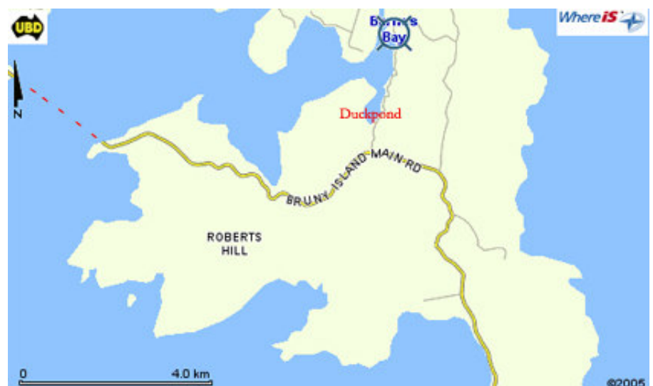
How to get there - North Bruny Island