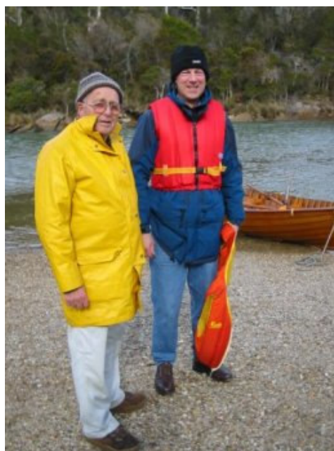
Two colourful characters caught on camera at the creek. (GH)