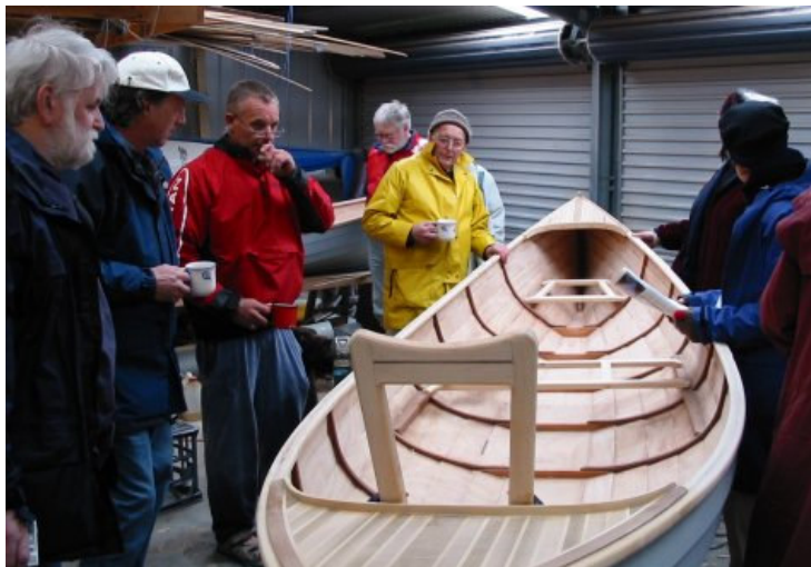
Admirers cluster around Colin's Adirondack skiff (PH)