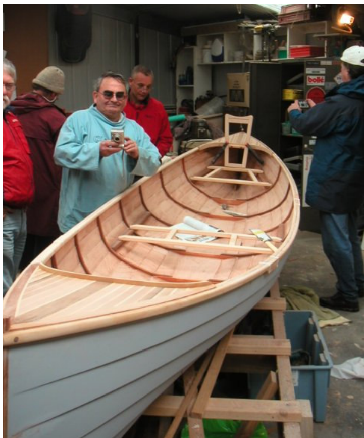
The President is dazzled by it (MZ)