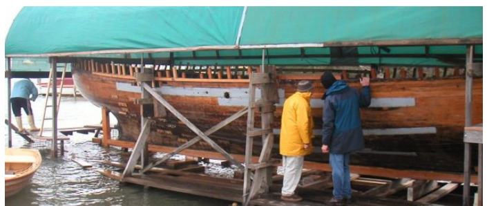
Examining the Corahyn - side view