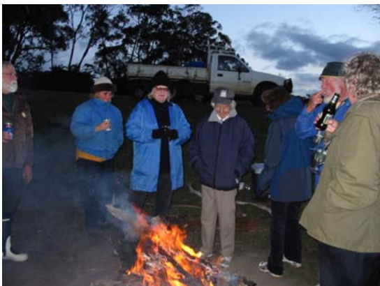
The camp fire at night!

Part of the cleanup included the gathering of firewood for the nights traditional on shore bar-b-q which went down its usual treat except for Roscoe and Terry going AWOL for some 2 hours?? The moonlight row back to the anchored boats proved to be a delight once again.