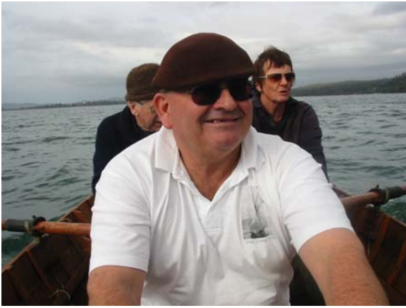
Teepookana heading towards “Marions”