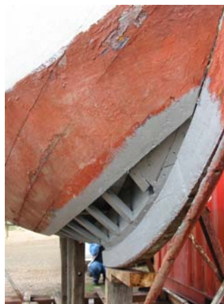
The “Jack” boat ready for the new keel