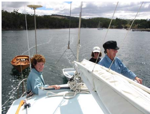
The Farewell crew heading home