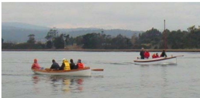
Mystic under oar!

Again only talking for the crew who checked into “Norfolk Ridge” awaking to the breakfast, that was included in the tariff, was just quite scrumptious and filling. Those who partook of the cooked breakfast generally had to share it with others because it was just a little on the large but delicious side.