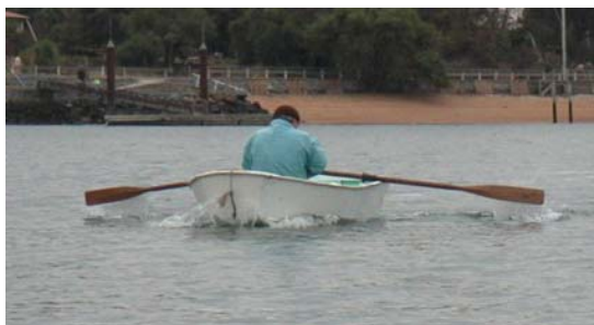
Presidents punt in action

We were booked into the “Iron Pot” winery for tastings at 4.00pm and the wines and cheeses were just beautiful. However. These were topped by the stunning views of the Tamar from the tasting rooms looking down through what was obviously a very old and well established garden area. This primed one part of the crew for continuing drinks and nibbles at “Norfolk Ridge”. It is amazing what people seemed to be able to find in their “ports” (cases/bags).