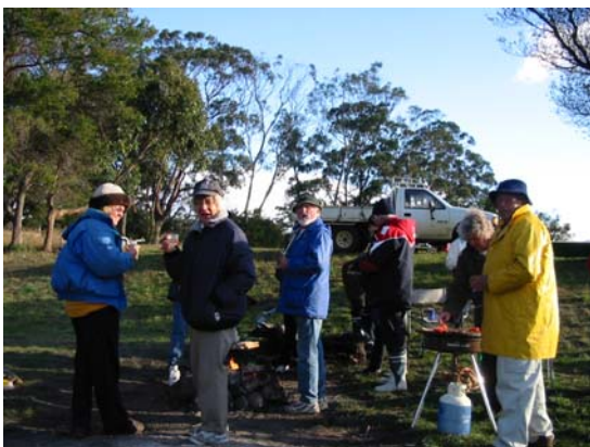
Breakfast in the morning!

Day break saw the on shore preparation for the